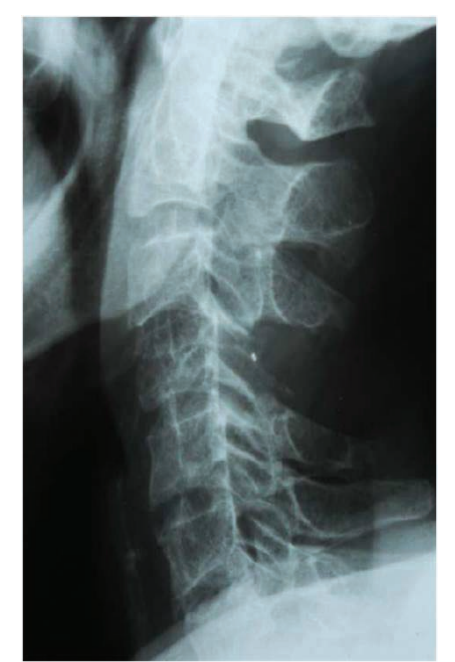
Figure 1. X- ray examination of the cervical spine: lytic lesions of C4.

MM is not rare, occurs in 55-70%, especially in the lower thoracic or lumbar vertebral bodies.4 However, the cervical spine seems to be involved less often and spinal cord compression following vertebra fractures or vertebra plasmocytomas comprises 5% of the presentations of MM.5.6 Between 1993 and 2005, 35 patients with MM of the cervical spine were identified.<sup>7</sup> The most common manifestation was pathological fractures of C2.7 Myeloma cells, which invade the marrow spaces of the spine, induce secretion of osteoclast-activating factors, including interleukins. These interleukins result in production of tumor necrosis factors, which promote further osteolysis.8,9 Spinal cord compression is usually caused by primary involvement