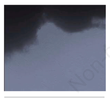
Figure 1. Keloid fibroblasts on day 8.

Note: *based on unpaired t-test (p<0.05).