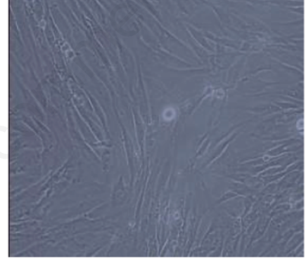
Figure 2. Keloid fibroblast day 14.

tion in proliferative phase and delayed remodeling. In addition, a theory has stated that keloid occurs due to the prolonged inflammatory phase.<sup>1,13</sup> Leukotriene is one of the arachidonic acid metabolites, which is released through 5-lipoxygenase pathway (5-LO).<sup>7,9</sup> Leukocytes are the main source of leukotriene. However, other cells such as macrophages, monocytes, fibroblasts, epithelial cells, and platelets are also able to produce leukotrienes. Leukotriene B4 is a potent lipid mediator released by the activation of neutrophils, macrophages, and mast cells; as well as a chemoattractant that is a fibroblast chemotactic factor.14 In prolonged inflammation, such cells would stay throughout the wound healing process with the total amount of macrophages and leukocytes higher in keloid fibroblast than those in normal fibroblast.14 The level of leukotriene B4 increases in several skin disorders such as atopic dermatitis, psoriasis, and systemic sclerosis though based on the researcher's knowledge, there has been no prior studies on the LTB4 level in keloid. In the study, the level of LTB4 in keloid fibroblast was significantly higher than normal skin fibroblast with the significant value (2-tailed) of LTB4 0.01 less than the p value <0.05 as seen on Table 1. The study result is in tune with a theory stating that keloid pathogenesis occurs as a conse-