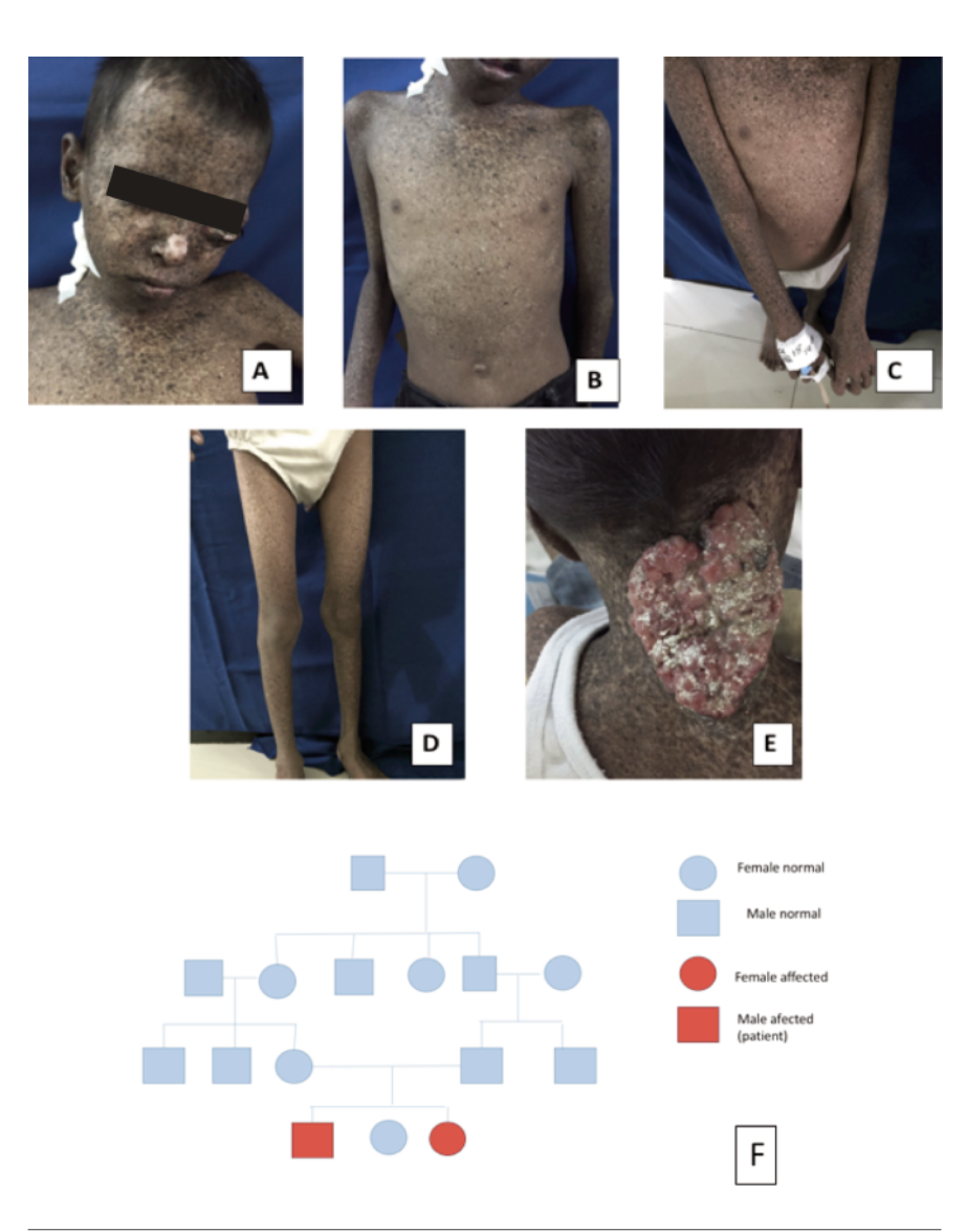
Figure 1. A. face showing numerous freckles and proliferation in left eye. B-D. Hyperpigmented and hypopigmented macules papules in the trunk, extremitas superior and inferior. E. Large ulcer squamous cell carcinoma over his neck. F. Picture of pedigree from this patient show that his parent did consanguineous marriage.

It is common for persons with XP - and this includes our patient – to have ocular abnormalities caused by ultraviolet-induced DNA alteration to epithelial cell conjunctiva, the cornea, and the eyelid. Also common are photophobia, conjunctivitis, and keratitis that may lead to leukocorneal, hyperpigmentation of the eyelids, loss of eyelashes and malignancies, including