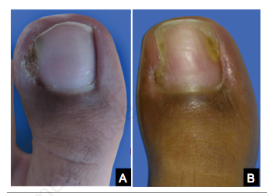
Figure 1. Ingrowing toenail on the left thumb. A) Before surgery; B) Two months after surgery.