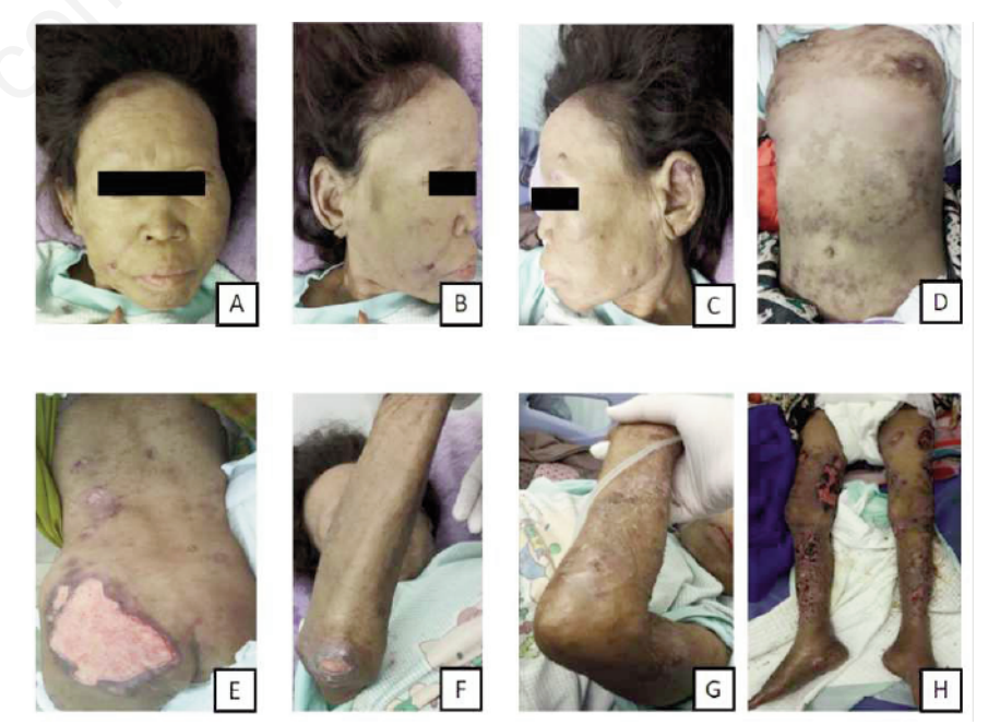
Figure 1. (A) Facial diffuse infiltration and madarosis, (B,C) Earlobes thickening, (D) Hyperpigmented macules on the abdomen, (E,F,G,H) Multiple ulcer and necrotic tissue with slough eroding area.

Dual infections by M. lepromatosis and M. leprae accounted for 14 (16.1%) of all