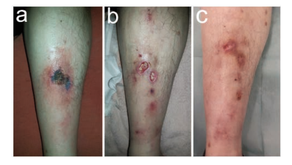
Figure 1. Clinical presentation and skin lessions evolution. a) A solitary initial lesion appeared pre-tibially on the right limb as a large and painful exulceration covered by a necrotic scar. b) Several painful ulcers with a fibrinous bed and an elevated, violaceous, undermined border, were observed two weeks after. c) Almost complete healing was observed three weeks after Imatinib was withdrawal.