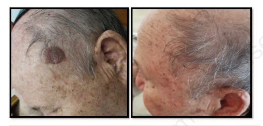
Figure 1. The skin before and after hyperbaric oxygen therpy. A) before treatment; B) after treatment.

The natural history of SK is a slow progression over time and complete remission is not expected. The only available treatments for SK include surgical removal, cryosurgery, curettage, electrodessication, shave excision or laser therapies (CO2, YAG).<sup>3-5</sup> To the best of our knowledge, this is the first reported case of complete resolution of SK without local intervention. Had the lesion not been so large in size and not at such a notable location, we would have probably missed HBOT's effect on the lesion. Until this case, we have not moni-