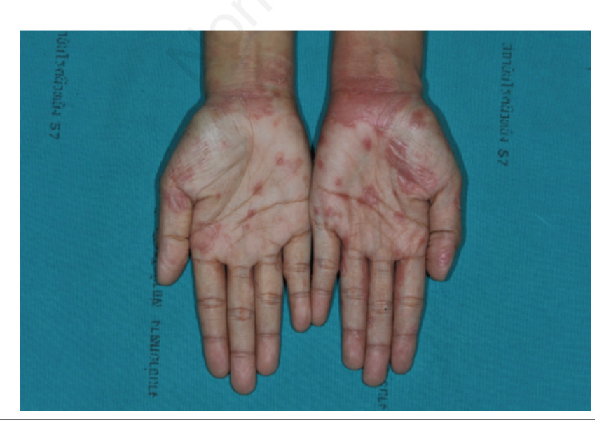
Figure 1. Typical erythematous papules with collarette scales on the palms.

©Copyright: the Author(s), 2021 Licensee PAGEPress, Italy Dermatology Reports 2021; 13:9081 doi:10.4081/dr.2021.9081