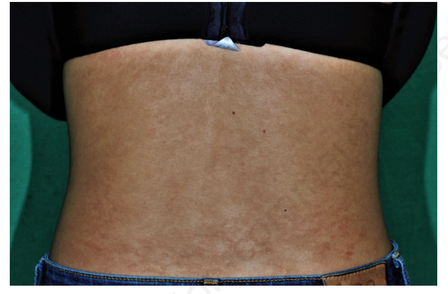
Figure 3. The rash distributed along cleavage lines of the back or a "Christmas tree" distribution.