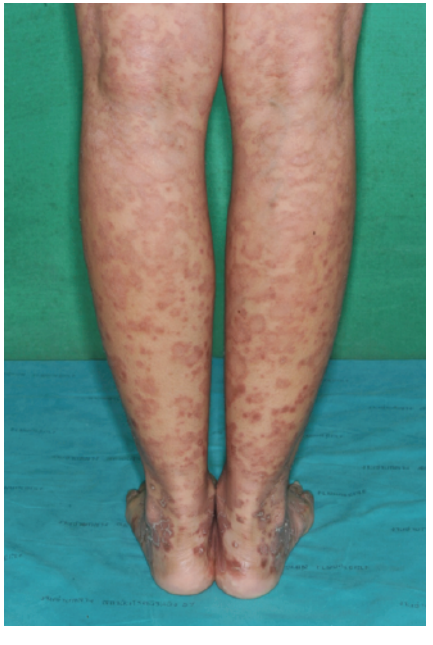
Figure 2. The generalized eruption was evidenced on the entire legs.with collarette scales on the palms.