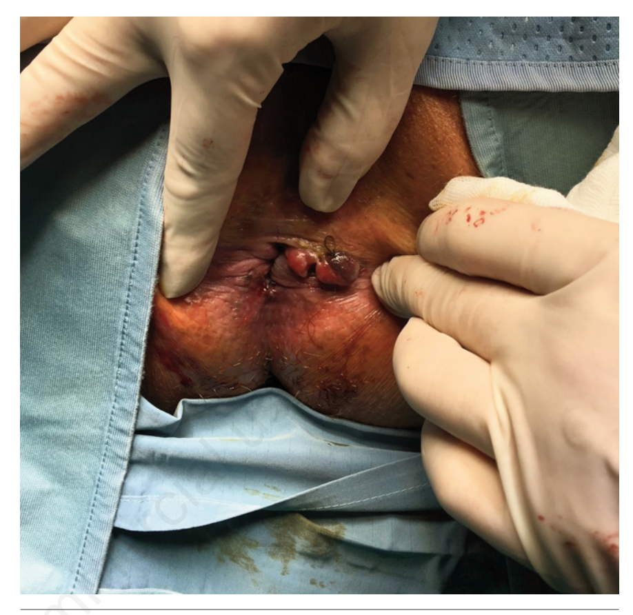
Figure 1. Preoperative clinical imagine: the large partially pigmented polyp mass of the primary mucosal melanoma.

scopic presentation consists of a unique, non-pigmented, ulcerated lesion in the gastric body, where multiple biopsies are diagnostic; as it happened in our case.<sup>7</sup> Another manifestation consisted of pigmented nonulcerated lesions. Recently also endoscopic