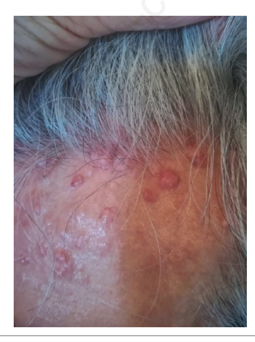
Figure 2. Skin-colored papules on the frontal area.