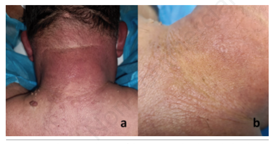
Figure 1. a) Erythematous induration of the posterior neck and upper back with scant excoriations; b) highlight with skin surface papulation and peau d'orange appearance.

There are different approaches for the treatment of scleredema diabeticorum. Tight glycemic control is recommended irrespective of its lack of proven effectiveness on established skin lesions. Several direct skin treatment modalities are available. UVA-1 phototherapy and PUVA seem to be the most effective treatments for this condition. Combination therapy seems to be the break-even point.