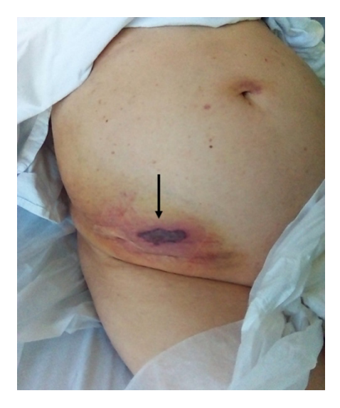
Figure 1. Painful necrotic lesion (arrow) with perilesional erythema in the right iliac fossa of the abdominal wall.