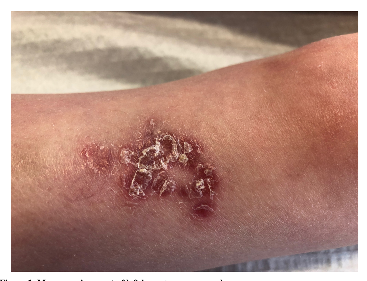
Figure 1. Macroscopic aspect of left leg cutaneous granuloma.