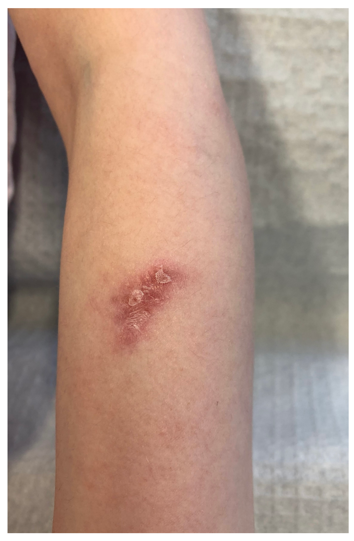
Figure 2. Macroscopic aspect of left forearm cutaneous granuloma.