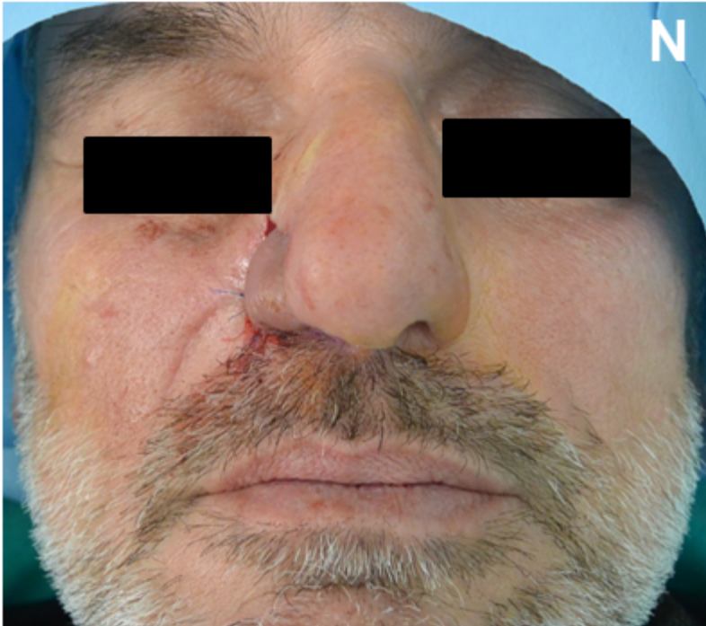
Figure 7. Removed sutures.