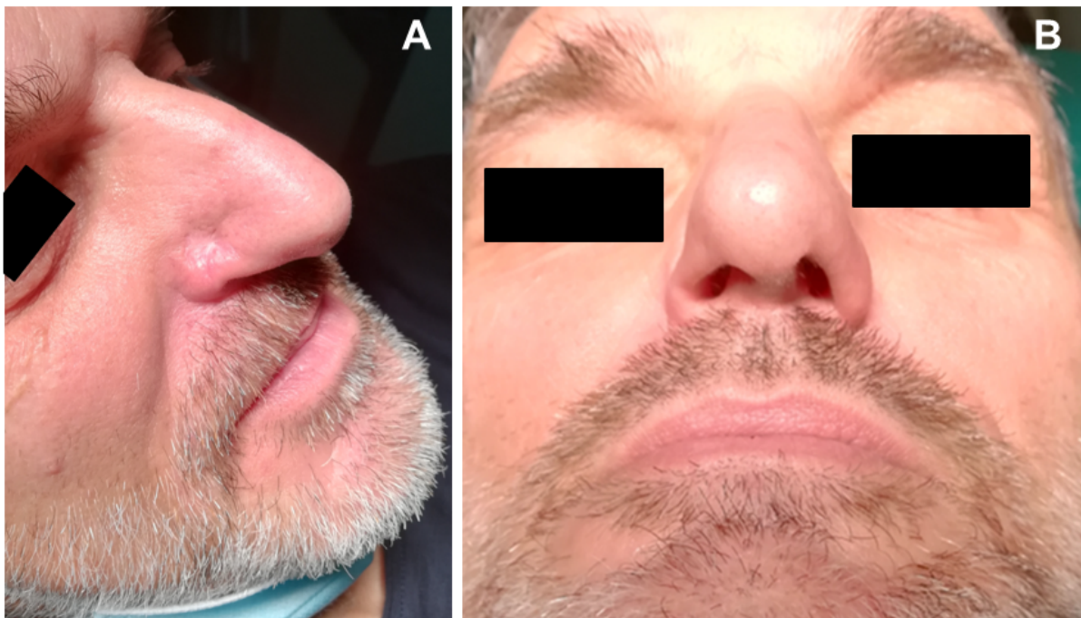
Figure 1. Basal cell carcinoma on the right nasal ala.