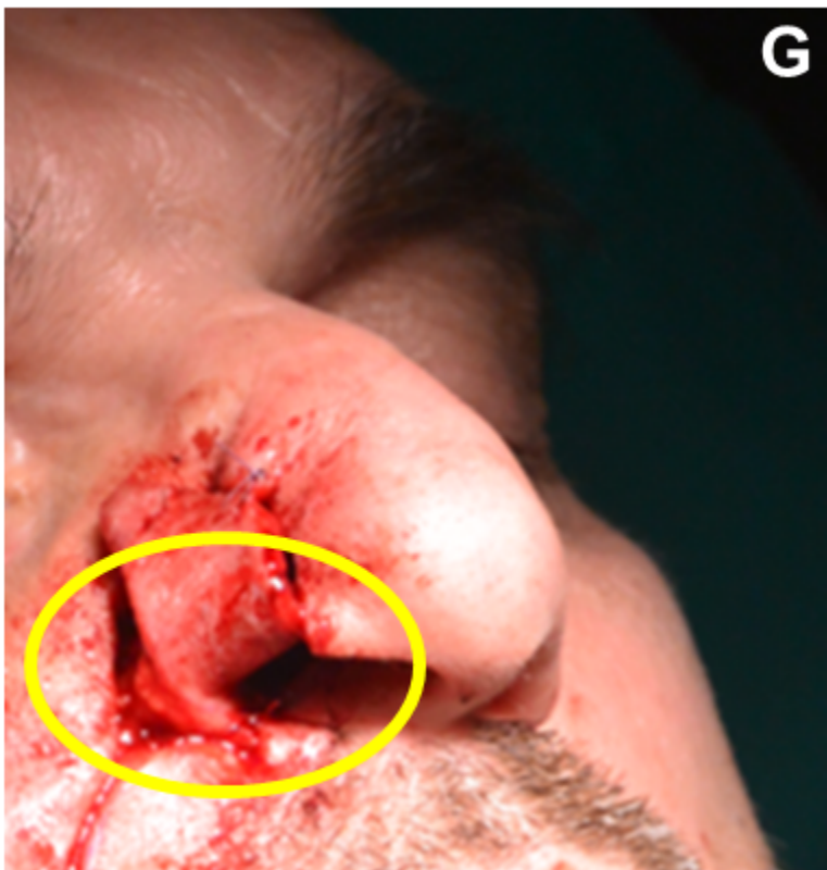
Figure 4. Rotated lateral aspect of the folded flap.