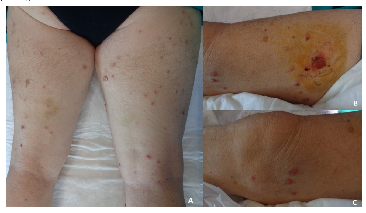
Figure 1. A) multiple small nodular lesions on both thighs and legs; B) an exophytic, sharply demarcated, asymptomatic, ulcerated, red nodule (40x35 mm) on the right thigh; C) multiple small exophitic nodules on the left knee.