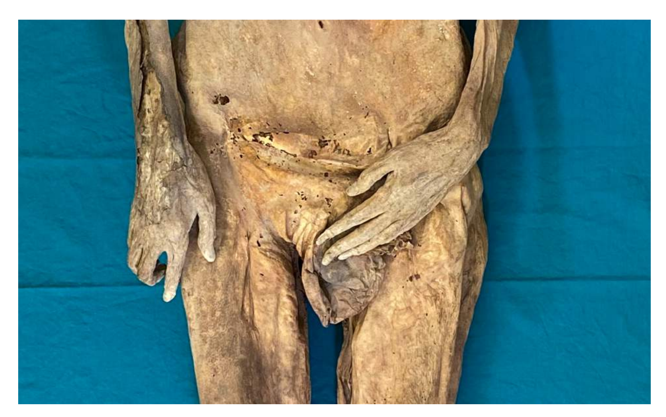
Figure 3. The flexion of the upper left limb shows no signs of ligatures that could justify the position in any other way.