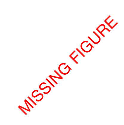
Figure 1. Missing figure