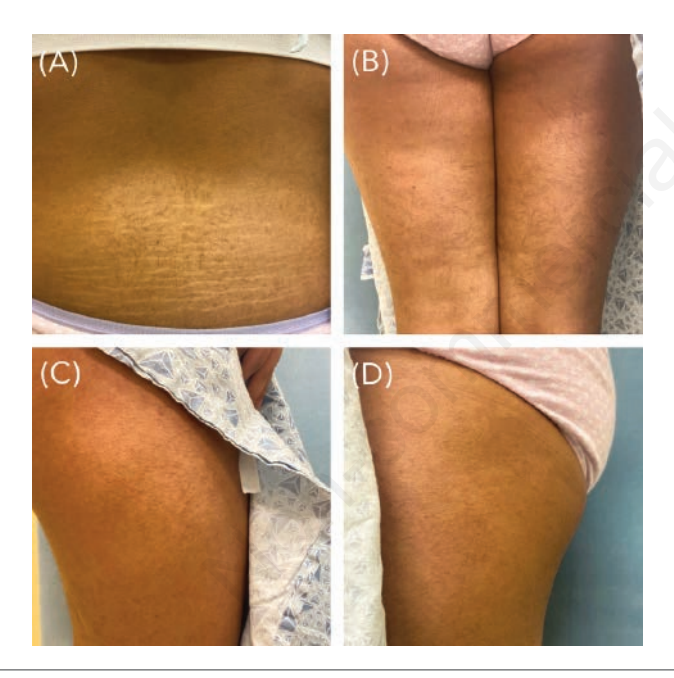
Figure 2. Post-treatment clinical photographs showing resolution of hypopigmented patches on the lower back (A), and the legs (B, C, D).

specific histological features can help to narrow down this elusive diagnosis. Furthermore, we report excellent results from a combination therapy that is hypothesized to be efficacious but has been poorly studied to date.