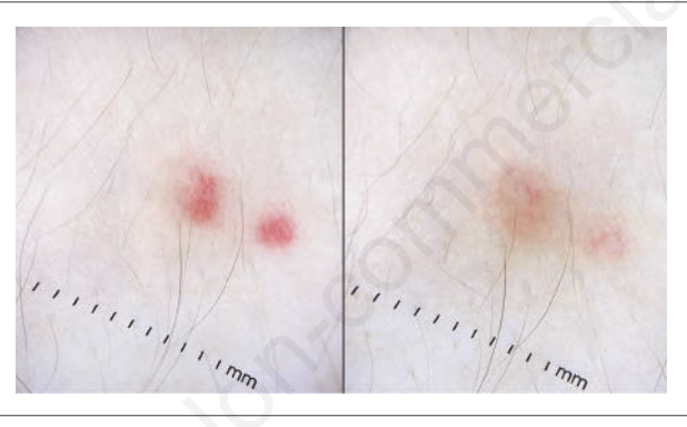
Figure 2. Dermoscopic images of eruptive pseudoangiomatosis showing blanching under pressure (Dermlite DL4W, California, USA).