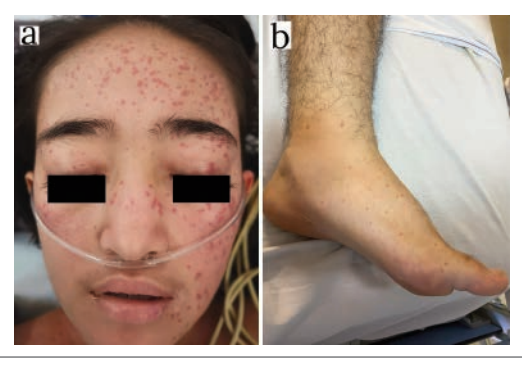
Figure 1. a) Angioma-like papules in a 21-year-old HIV-positive woman; b) Pinpoint erythematous papules with a pale halo in a 19-year-old male with non-Hodgkin lymphoma.

precise cause of these changes has not been elucidated, but it has been theorized that it might be a dermal hypersensitivity reaction to a viral particle or a direct viral effect on the vascular endothelium. There are no specific laboratory findings. No specific treatment is required and lesions usually resolve spontaneously in one to two weeks. In conclusion, Eruptive pseudoangiomatosis is a pathology not widely known and probably underdiagnosed due to the fact that it is self-limited. More studies are needed to establish a known etiology and associations.