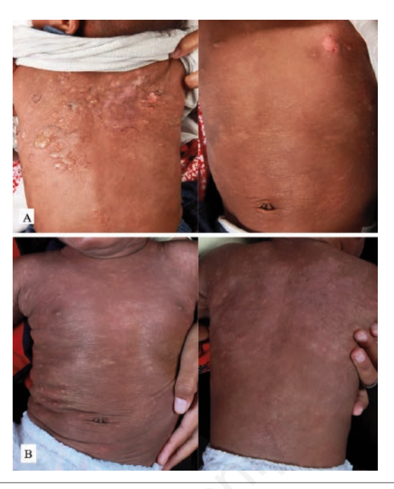
Figure 1. Clinical picture of the patient at initial visit: blisters and erosion distributed on the trunk (A), and the development of new urticarial plaques after blisters resolution (B).

Two weeks later, the symptoms were improved, but there were still new erythematous wheals on the back, face, and chest. During the examination,