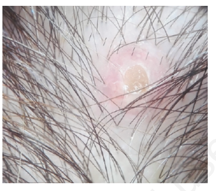
Figure 3. Dermoscopic image (20X) of one 5 mm papule of the scalp with the typical central orifice surrounded by crown vessels.