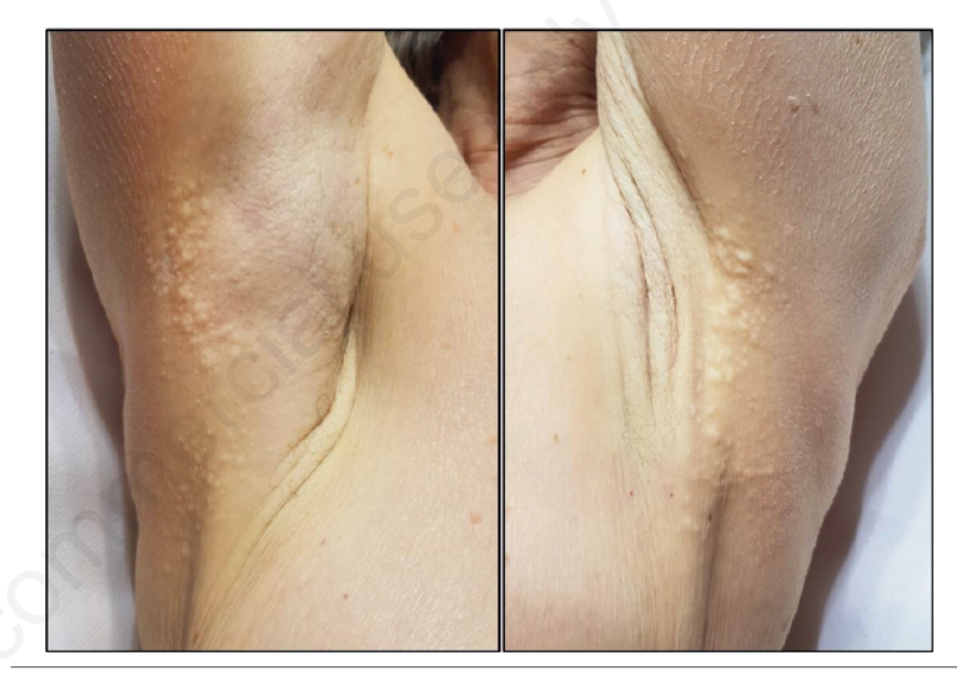
Figure 1. Clinical presentation of late-onset focal dermal elastosis: yellow-white non-follicular papules symmetrically distributed along the posterior axillary folds.

mRNA levels of elastin as well as the expression of other molecules related to elastin metabolism, such as fibrillin-1, fibulin-5, latent transforming growth factor-ßbinding protein-2 (LTBP-2) and LTBP-4 are increased.10,11 Location on flexural regions might suggest a role for repetitive mechanical stress. The condition may have a higher prevalence and be underreported, because it is clinically subtle and often asymptomatic. and histopathological recognition requires elastic fiber staining in addition to routine histology. In the first report of LOFDE, Authors stated that they had seen several similar cases in the elderly but could not confirm the diagnosis by histological exam-