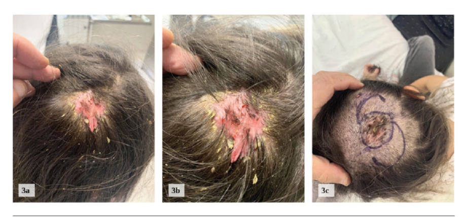
Figure 3. a-b) Flat irregularly shaped, flesh coloured lesion with multiple honey-coloured crusty squames. c) Preoperative markings of both lesion with additional surgical safety margins and etchings of each flap.

We have presented a successfully performed double hatchet flap in the occipital scalp zone in a 65-year-old patient with subsequent histopathologically verified trichoepithelioma (Figures 1 and 2). Additionally, we show a perfect result after removing an intradermal irritated achromatic melanocytic nevus of the occipital scalp zone using again the double hatchet flap (Figures 3-5). Interdisciplinary collaboration between dermatologists and surgeons is a serious prerequisite for achieving an optimal end result.