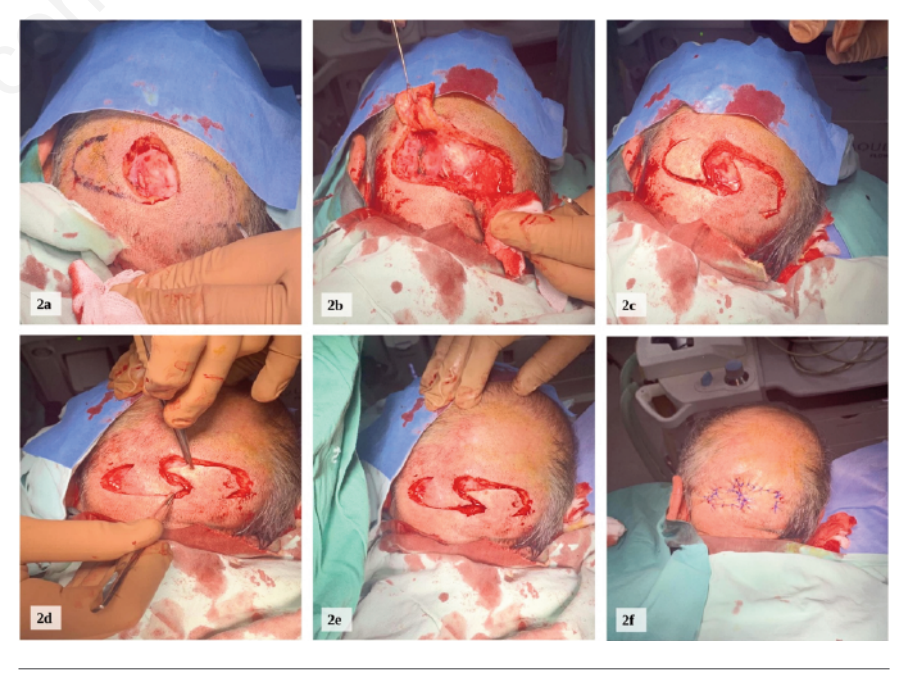
Figure 2. a) Oval excision of tumor. b-c) Intraoperative preparation of flaps. d-e) Transposition of the flaps to cover the defect. f) Complete closure of the defect with uninterrupted nylon sutures.