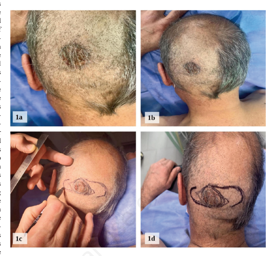
Figure 1. a-b) Oval hyperpigmented lesion on the occipital region of the scalp. c-d) Preoperative markings with 2-3mm safety margin

Due to the limited elasticity in the scalp