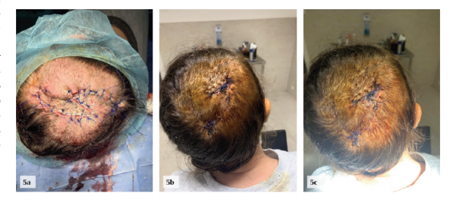
Figure 5. a) Complete closure of defect with single interrupted sutures. b-c) Postoperative follow-up images with progression to good wound healing.