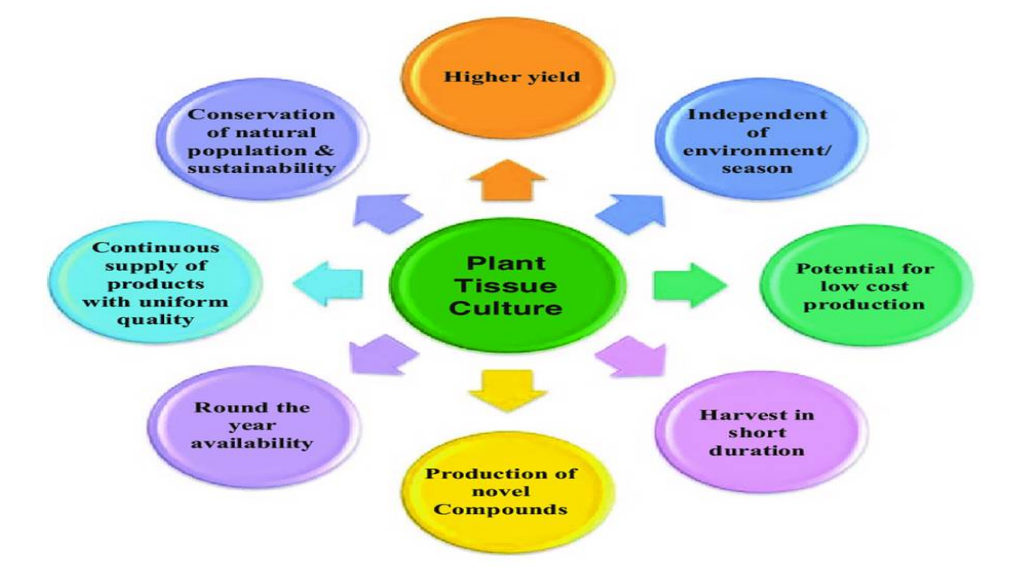
Figure 3: Applications of Plant tissue culture

The in-depth information on the use of plant tissue culture (Figure: 3) is provided below-