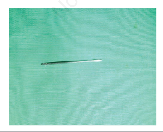
Figure 3. Metallic needle after surgical exploration.