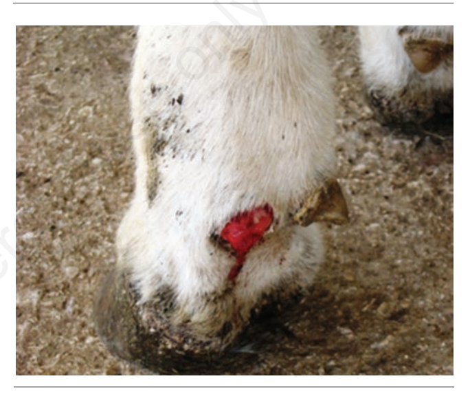
Figure 4. Sloughed dewclaw in a heifer affected with malignant catarrhal fever in Jordan.