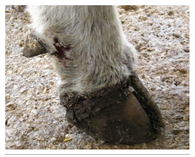
Figure 3. Necrotic and ulcerative skin over the coronary band of a heifer affected with malignant catarrhal fever in Jordan.