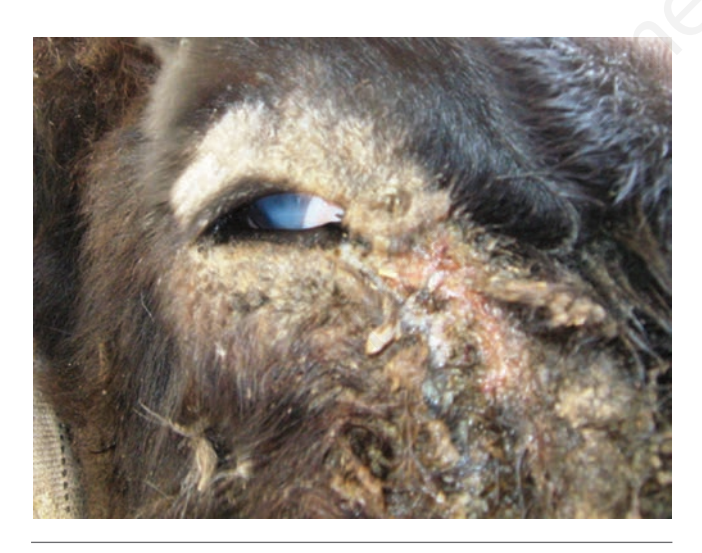
Figure 2. Corneal opacity in a heifer affected with malignant catarrhal fever in Jordan.