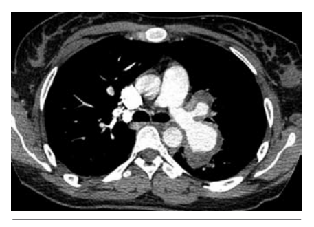
Figure 1. Large pulmonary artery aneurysms.

It can be a challenge to diagnose HSS due to the nonspecific nature of its clinical pres-