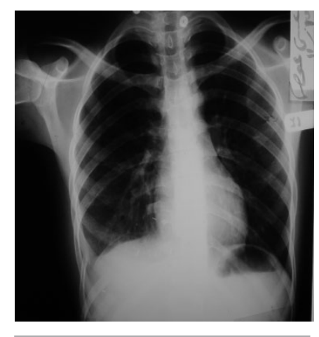
Figure 2. Resection of right 8<sup>th</sup>, 9<sup>th</sup> rib and using synthetic mesh.