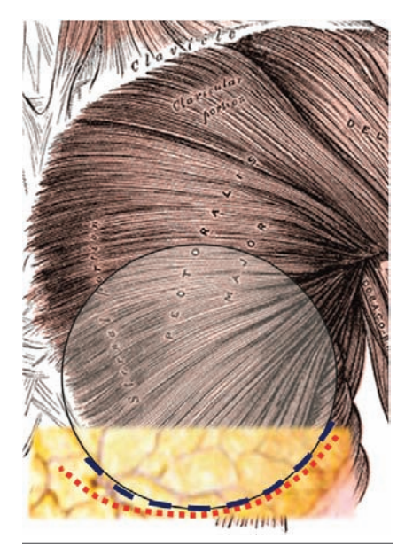
Figure 11. Composite pocket for immediate insertion of permanent silicone implant after mastectomy. The anterior part of the pocket is composed by pectoralis major (supero-medial) and servatus anterior (lateral) in the upper 2/3 and by a continuous laver of soft tissue (fibroadipous layer and overlying skin) in the lower 1/3; the red dotted line indicates the section line of the muscles and deep fascia, exactly under the inframammary fold, the blue dotted line indicates the section line of the superficial fascial system a few millimeters above the previous incision. This is a retouched picture, i.e. digitally altered from its original version ( M. pectoralis major by H. Gray, Anatomy of the Human Bod, Philadelphia: Lea & Febiger, 1918). The original version can be viewed in Wikipedia: Grav410.png.

inframammary zone, and then necessitate an expander insertion instead of a definite prosthesis, or an alloplastic mesh reconstruction with major costs for the patient or the hospital. The overall preference for a lateral radial, even in presence of previous areola scars, is supported by data reported in literature and by our experience (less than 1% of areola necrosis, in this series). An incision of at least 30% of areola circumference was indicated as independent risk factor for necrosis by Garwood et al. decreasing the same to a 5% rate.<sup>23</sup> Of course, this can be insufficient when not associated to a dissection preserving the subcutaneous fatty layer and its vascular network. The same authors detected a further risk factor: the immediate reconstruction with fixed-volume using either implants or autologous tissue flap. They explained the current risk in autologous flaps because nipple-areola complex could survive better over a well vascularized pectoralis muscle during the first days. Based on biomechanical principles, it is not fixed-volume that represents a hazard, but the pressure