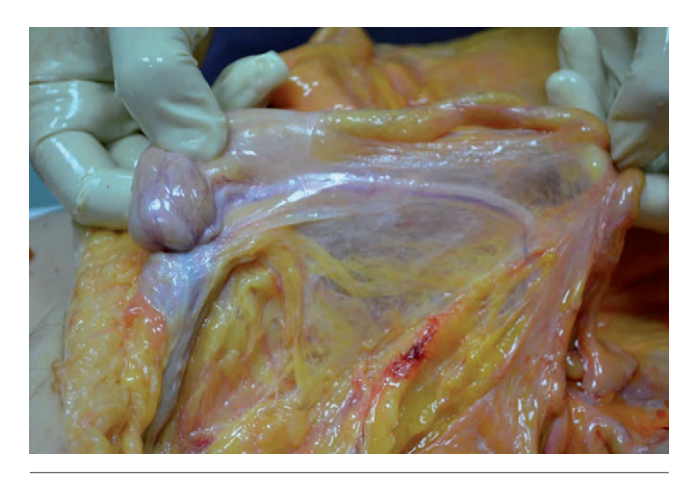
Figure 4. Testicular dysgenesis with right cryptorchidism.