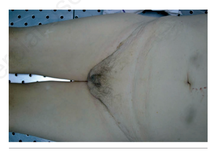
Figure 3. Hypogonadism and micropenis of the man.