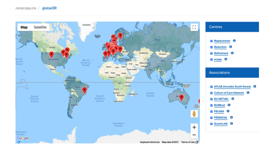
Figure 2. Norecopa's interactive map of 3R Centres and networks within Laboratory Animal Science and alternatives: https://norecopa.no/global3r

resources; ii) Norecopa has launched a Refinement Wiki (https://norecopa.no/wiki), where scientists or animal care staff can publish large or small changes they have made to protocols which improve the quality of animal care, research and testing. The Wiki is designed