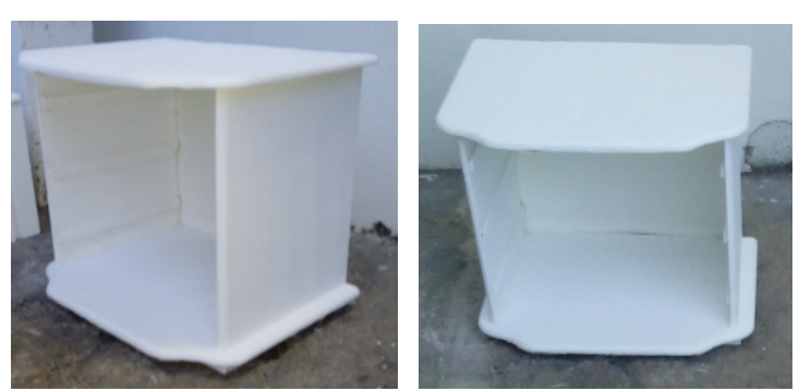
Figure A7. Bedside table after application of the fifth and final coat.