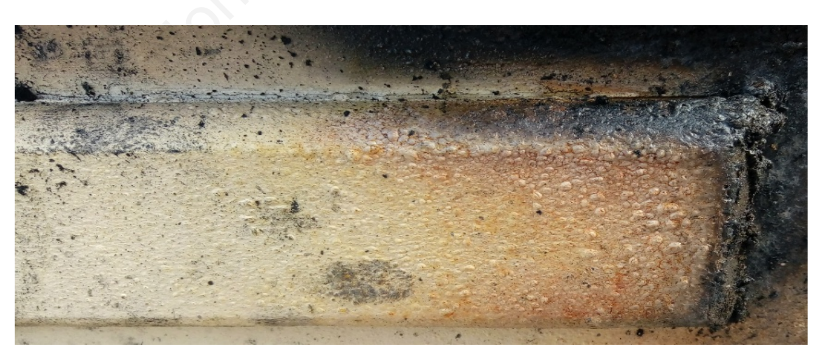
Figure A9. Drawer handle of bedside table highlighting the expansion of intumescent paint after heating.