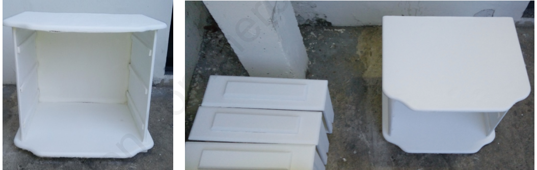
Figure A6. Bedside table after application of the fourth coat.