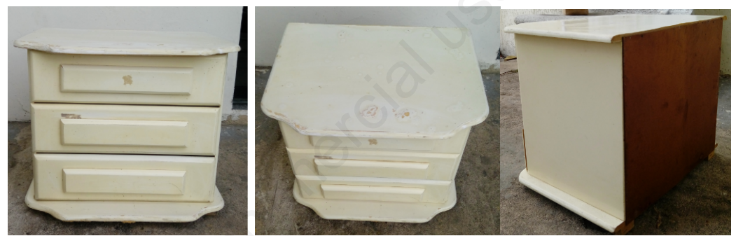
Figure A2. Bedside table before the application of the intumescent product.