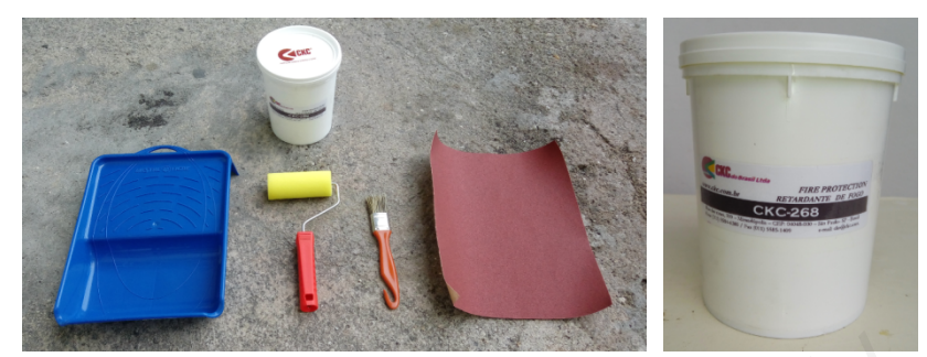
Figure A1. Material used to paint the bedside table.