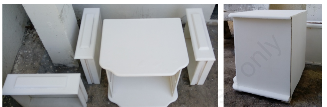
Figure A5. Bedside table after application of the third coat.