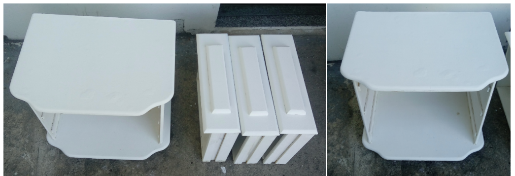
Figure A4. Bedside table after application of the second coat.