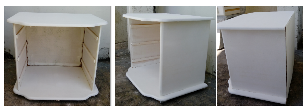
Figure A3. Bedside table after application of the first coat.